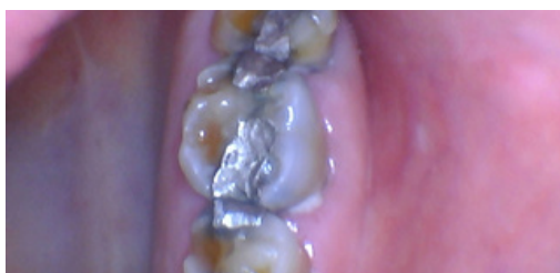
62 yo, Benton Co., this patient receives regular care, without it she would have lost all her teeth due to the impact of medications and other health issues.