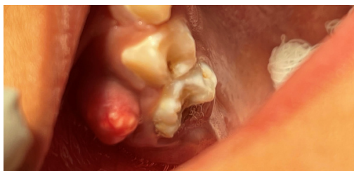
2yo, Marshalltown, infection from cavity. 2 teeth pulled, 6 crowns and 6 root canals.