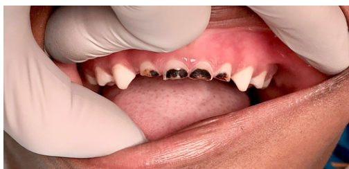
4yo, Fort Dodge, with decay. 12 crowns and 8 root canals in OR.