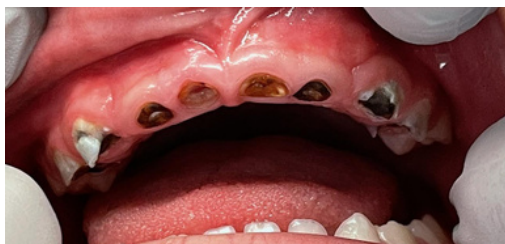
3yo, Knoxville, with large abscess that was drained and tooth removed. 12 crowns and 6 root canals in OR.