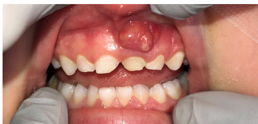
3yo, West Des Moines, with decay on teeth causing pain and infection. Teeth extracted in the OR. He will not have any teeth until permanent teeth come in at about 7.

Untreated dental infections can spread to other parts of the body. This leads to increased Medicaid medical costs, including ~$2M in ER costs in 2020.