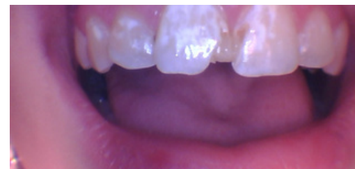
18yo, Benton Co., decay caused tooth to break.