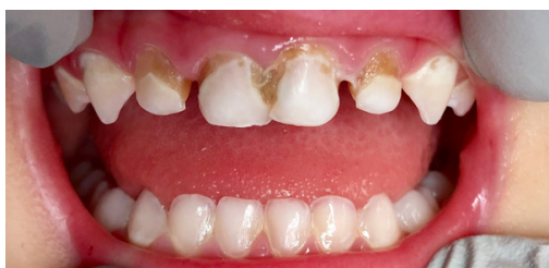
3yo, Jasper Co., with cavities on front teeth.