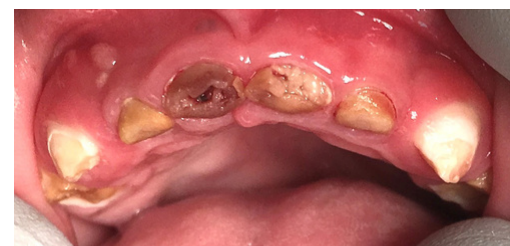
1yo, Des Moines, decay exposed nerve on 2 front teeth, 6 extractions and 8 crowns. She won't have front teeth until she is about 7.