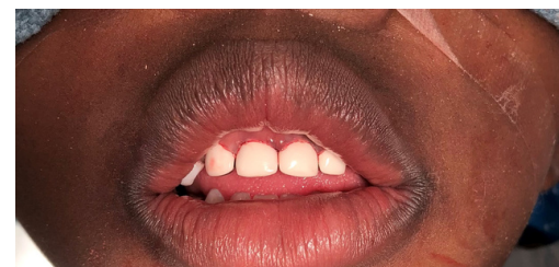
After treatment from photo on the left.