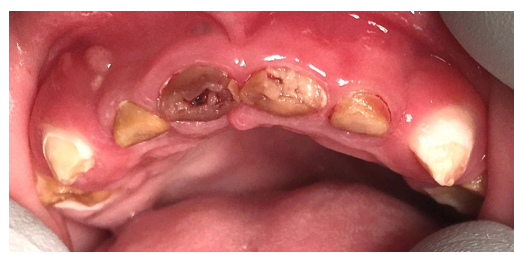
1 year old, Des Moines.