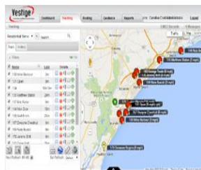
Full GPS Portal